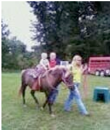
Enjoying a pony ride at the Annual Country Picnic

Now, with some electrical work on the lights & outlets, carpentry work hanging doors and trim, ceiling tile and paint – along with volunteer help to cut & drill wood for projects, we'll be ready to start working!